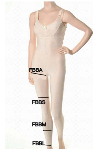
* The FBB in the Second Stage